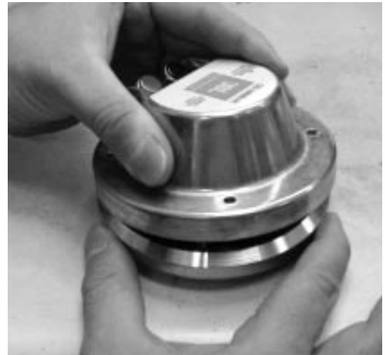
2435H compression driver, showing a re-fitting of the back cover prior to replacing the mounting screws. Gold-plated knife-switch type contacts complete the wiring circuit, and couple the cover and magnet structure together when the keyed slot is properly aligned.

The diaphragm assembly uses a precision-machined metal ring as its foundation. This ring fits into a matching groove in the driver's magnetic pole piece. Aside from a hex-head screwdriver, no other hand tools are needed. After cleaning the gap area using masking tape, follow instructions for refreshing the measured amount of ferrofluid. Drop the replacement diaphragm into place. The voice coil connections fit through holes in the driver's rear cap. Replace the four screws that secure the rear cap to the driver's body.